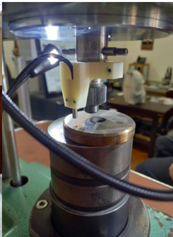
Rockwell hardness standard machine