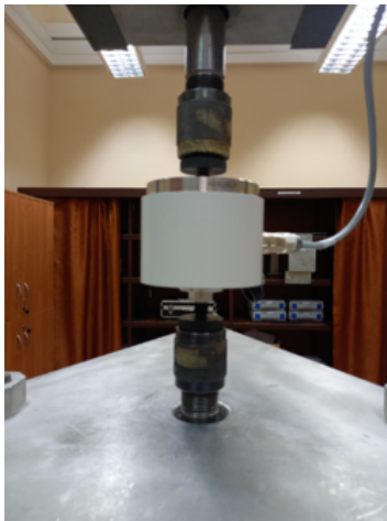
Force transducer during calibration