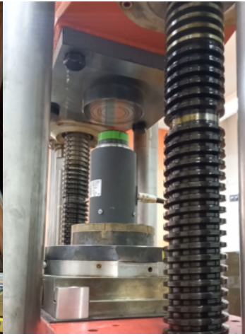
Force standard machine up to 500 kN